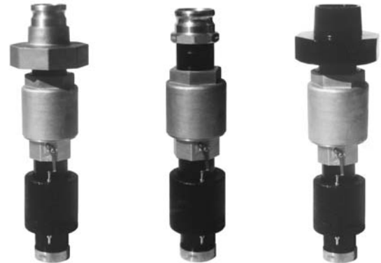
SHOWN WITH STANDARD ADAPTOR 9095A-0200 AV or 9095A-0300 AV